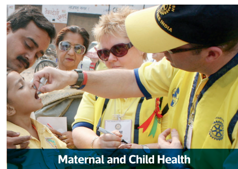
Maternal and Child Health