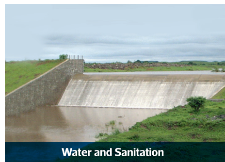
Water and Sanitation