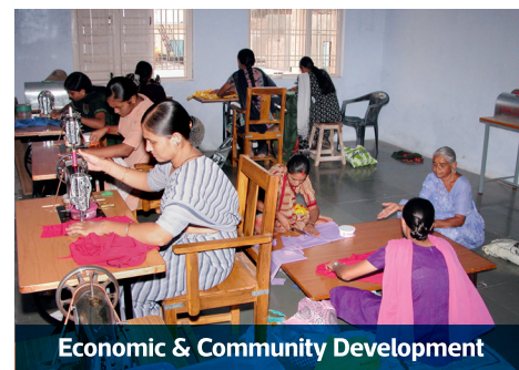
Economic & Community Development