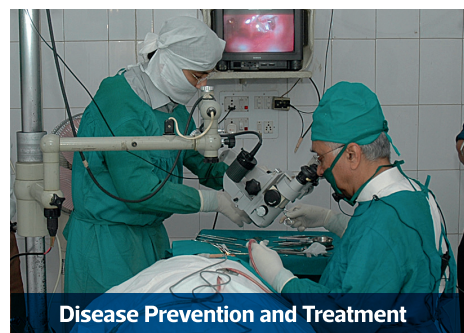
Disease Prevention and Treatment