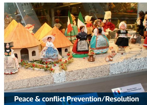
Peace & conflict Prevention/Resolution