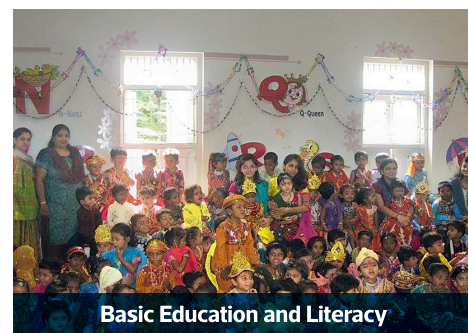
Basic Education and Literacy